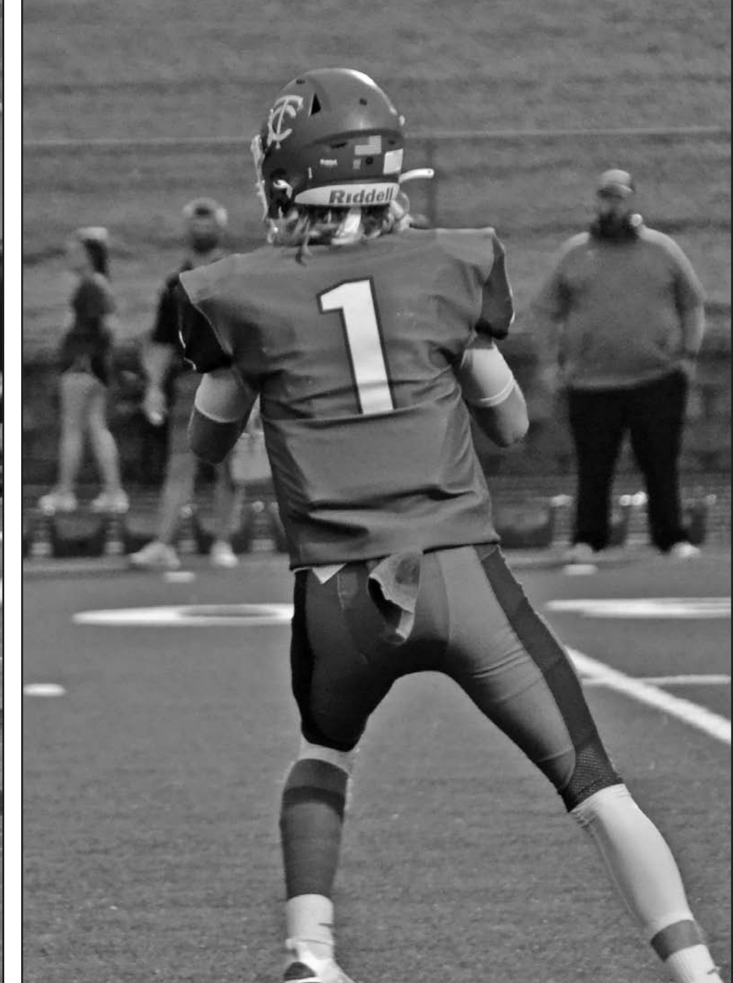
The Towns County offense finished with almost 400 yards of total offense while limiting Lumpkin to half that number.